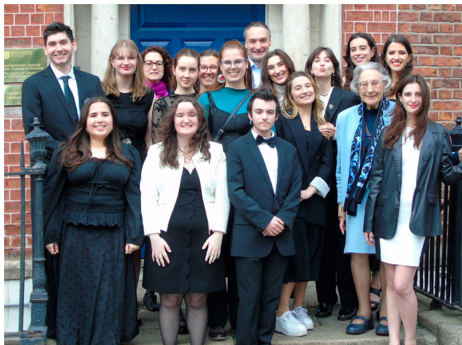
MPhil class of 2023–24

In April 2025, the MPhil class of 2023–24 had their graduation ceremony at Trinity. After the ceremony, we hosted a reception for the graduates and their families at the Centre. This is always a very happy reunion for our students who come from all over the world to mark the occasion.